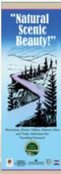
2010 "Natural Scenic Beauty!" Mountains, Rivers, Valleys, Historic Sites and Trails; Adventure for Traveling Pioneers!