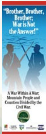
2011 "Brother, Brother, War Is Not the Answer!" A War Within A War; Mountain People and Counties Divided by the Civil War.