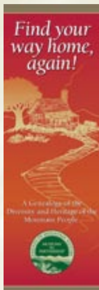
2008 "Find Your Way Home, Again!" A Genealogy of the Diversity and Heritage of the Mountain People.