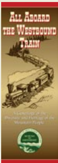
2006 "All Aboard the Westbound Train!" A Celebration of Trains, Depots and People of Western North Carolina.