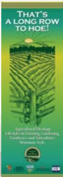
2009 "That's A Long Row To Hoe!" Agricultural Heritage; Lifestyles in Farming, Gardening, Foodways and Viticulture – Mountain Style