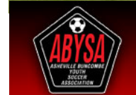
Youth Soccer at Buncombe County Sports Park