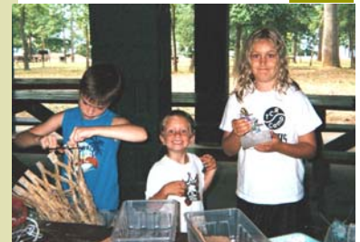
Last year's Summer Camp at Lake Julian Park.

Fees are due at the time of registration.