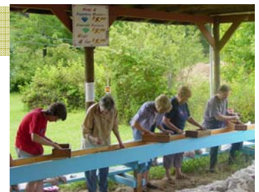
Gem Mining at Cowee Mines Franklin, NC

REFUND POLICY: Refunds will not be given unless a trip is cancelled due to inclement weather or lack of participation. (For more Sightseer updates see page 3.)