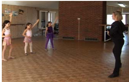
Learn to dance at the Zeugner Center in Skyland.