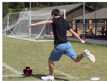
Adult Kickball at the Buncombe County Sports Park starts April 2