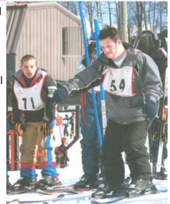
Special Olympians at Winter Games.