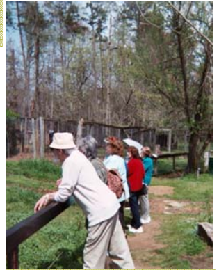
Sightseers trip to Hollywild Park in Inman, South Carolina.