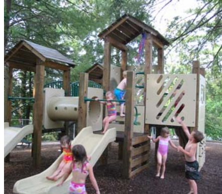
Children enjoying the playground at A-B Tech Child Care.

home address, fax machine or email address. Visit our website at buncombecounty.org/childcare .