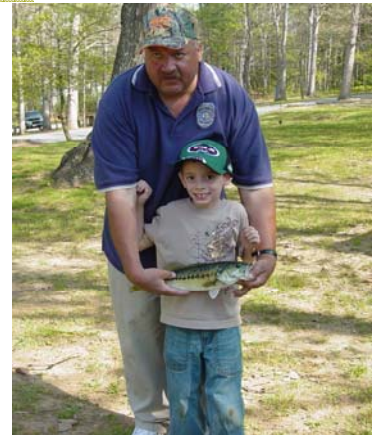
Catch the Big One at the Kid's Fishing Tournament on April 25.

Bring the family and enjoy the day at beautiful Lake Julian Park.